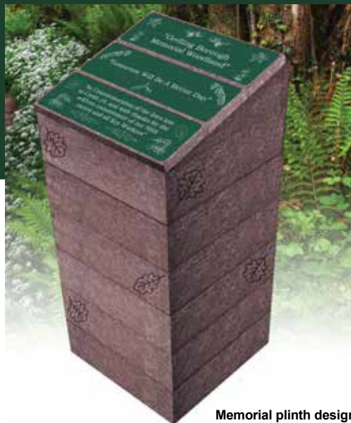
Memorial plinth design

The area is due to be opened later this year. You can donate to the scheme by visiting www.peoplesfundraising.com/fundraising/memorialwoodland