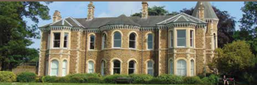
Arnot Hill House in Arnold

To find out more and search for sites near you, visit www.historicengland.org.uk